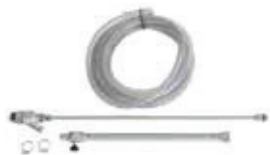
Professional Sand/Soda blasting lance kit