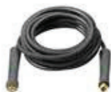
Rubber delivery hose extension kit