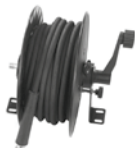
Hose reel kit with rubber hose